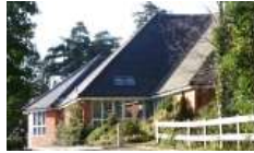
Forest Surgery Bordon