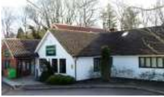
Badgerswood Surgery Headley

Available at surgery reception desks or by contact via the PPG email addresses. Donations welcome to cover the cost of printing (recommended £2).