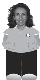
Alison Health CareTech (mauve tunic)

BP monitoring 6 week baby checks ECG's 24hr BP monitoring new patient health checks