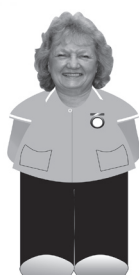
Debra Health CareTech (mauve tunic)

asthma checks (stable patients), cardio-vascular checks, health checks & vaccinations